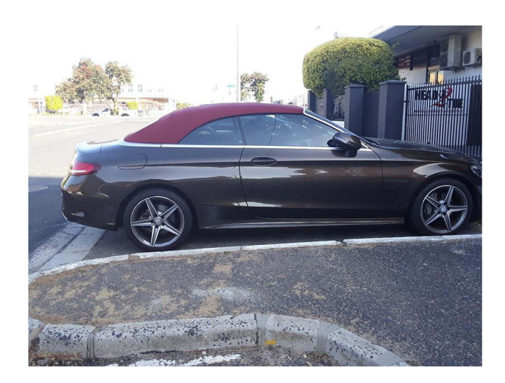
Figure 5 Future goals.

The participants in this study demonstrated the beneficial effects of having life goals on their mental wellness through their motivation to stay healthy to achieve their goals.