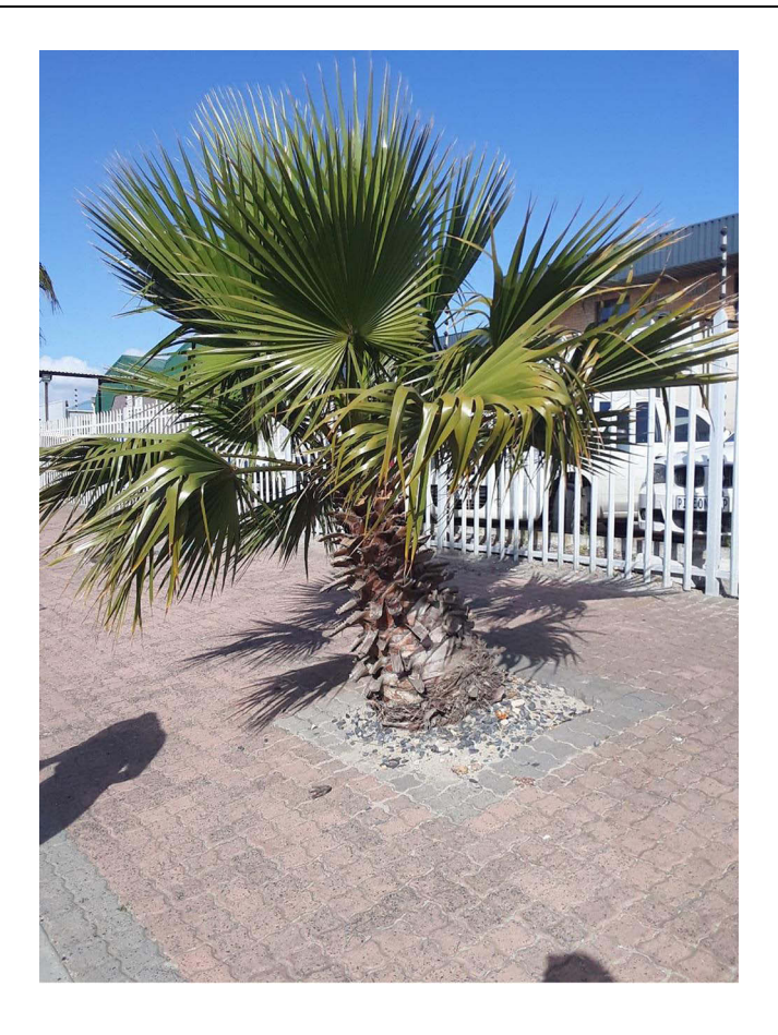
Figure 6 Strength in nature.