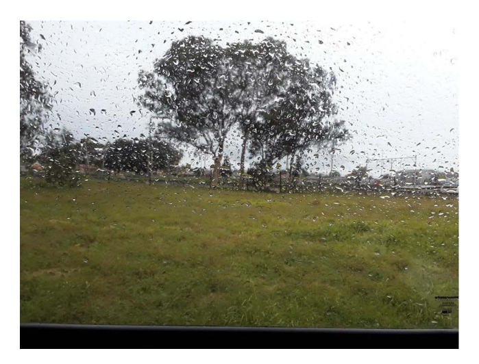
Figure 4 Weathering the storms of life.

"And also, I want to complete my school ... I want to complete school so that I can be successful one day" (Max, Boy, 16)