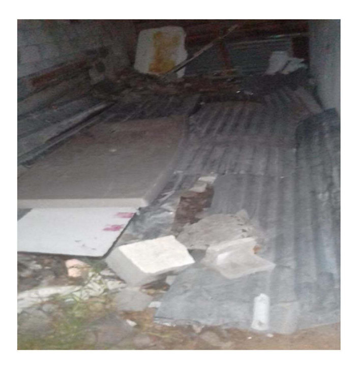
Figure I Making sense of living conditions.

I was, I was very ... curious about what happened in that, what happened in that place, and also, I was also sad because there are some children who get infected and bad diseases because of places like that ... and also, when I took this picture, I was thinking about how ... the people can let that happen when they are still there. (Sizwe, Boy, 16)