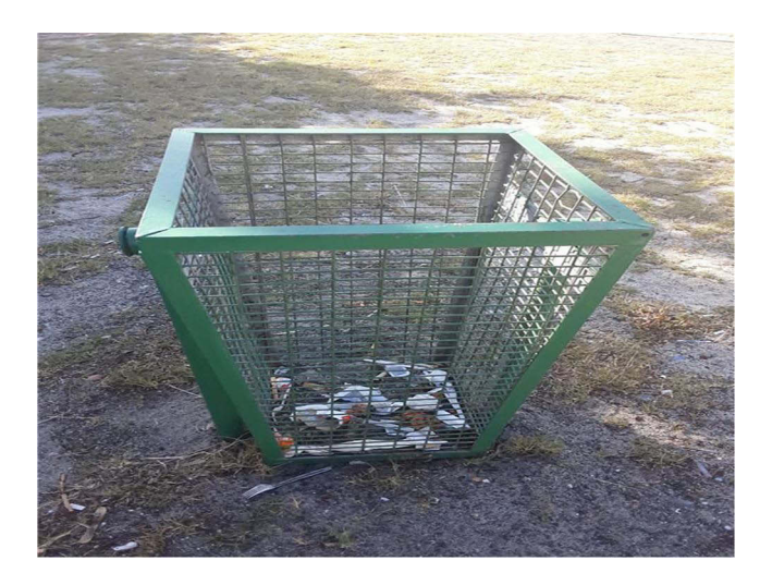
Figure 2 People are not trash.

her parents. The culmination of her low-self-esteem and her struggling relationship with her parents resulted in suicidal thoughts (hopelessness) and led her to default on her treatment. However, her relationship with other key figures in her life, such as her sister, friends, and her favorite nurse, provided her with the love and support she needed to help her feel better about herself [self-esteem] and her situation [hope]. Through this, she learned to accept herself and her HIV status which motivated her to re-engage in her HIV treatment.