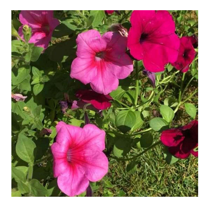
Figure 3 Nurturing health.

This flower is to show me how I am going to look if I keep on taking my medicine. It's like water to them. So if you water plants they will grow up and be beautiful like these so it reminds me every time I see those I should take my medicine so that I can be beautiful and strong like them (Stacy, Girl, 15)