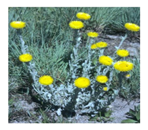
Figure 4. H. aureum. Source: SANBI [39].

The cytotoxicity study reported by Lourens et al. [40] revealed that the chloroform:methanol (1:1) extract of H. aureum displayed cytotoxic effects toward transformed human kidney epithelial (Graham) cells, breast adenocarcinoma (MCF-7), and glioblastoma (SF-268) cells at the tested concentration (0.1 mg/mL) with inhibition of 5%, 7%, and 35%, respectively.