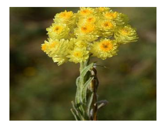
Figure 11. H. plicatum.

Eroglu et al. [76] reported that the methanol (100%) flower extract of H. platicum exhibits toxicity properties in human lymphocytes at 0.5 mg/mL concentration. A separate study conducted by Bigović et al. [77] documented moderate toxicity of the ethanol (100%) and ethyl acetate: ethanol (100:0) flower extracts of the plant against human cervix adenocarcinoma cells (HeLa), prostate cancer (PC3) cells, and myelogenous leukemia (K562) cells, with IC<sub>50</sub> values at 42.1 \pm 0.05 , 39.2 \pm 1.1 , and 25.9 \pm 1.5 \,\mu\text{g/mL} , respectively.