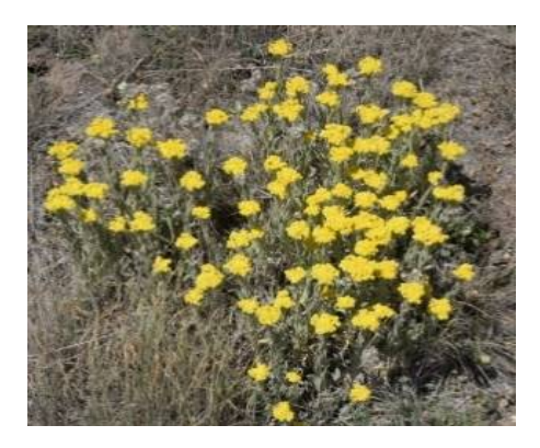
Figure 6. H. graveolens.

Helichrysum graveolens (Figure 6) is an herbaceous plant belonging to the Helichrysum genus, with grey-bushy foliage and thin everlasting flower-heads. The plant is native to Eastern Europe, Caucasus, Turkey, Iran, and South Africa [46]. Traditionally, the decoction from H. graveolens has been reported to be active in the treatment of diabetes mellitus in several regions of South Africa, Anatolia, and Turkey [46]. The capitulums of the plant are also reported to be consumed for the treatment of jaundice, diuretic, and wound healing in the rural districts of Anatolia [46].