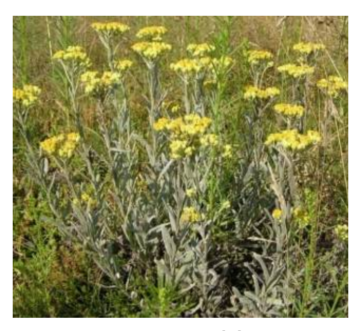
Figure 3. H. arenarium.

Kramberger et al. [36] documented the toxicity of H. arenarium . In the study, the authors revealed that the aqueous extract was only toxic at the highest concentration (5%, v/v) against lymphoma (U937) cells, while the same extract displayed toxicity even at 1% (v/v) concentration in both the human colorectal adenocarcinoma (Caco-2) and primary colon fibroblast (CCD112CoN) cell lines.