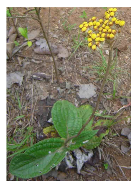
Figure 9. H. nudifolium. Source: Flora of Zimbabwe [67].

Helichrysum nudifolium (Figure 9) is a fast-growing plant with a light-yellow inflorescence and shiny green leaves. The plant's flowering stalks can reach 1.5 m in height. It is very easy to grow in the garden and is widely found in South Africa. In South Africa, it is one of the most important species culturally, medicinally, and historically [65]. Traditionally, the fresh leaves or roots of H. nudifolium are boiled and taken orally for the treatment of diabetes [66]. Additionally, the leaves and roots are also used as traditional medicine for wound dressing, internal sores, and chest complaints [65].