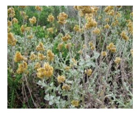
Figure 7. H. gymnocomum.

Helichrysum gymnocomum (Figure 7) is a straggling aromatic perennial herb with pleasantly scented flowers. The stems of the plant are often decumbent and rooting at the base while the leaves are very variable and pleasantly scented [24]. H. gymnocomum grows abundantly in the Eastern Cape and KwaZulu-Natal provinces of South Africa [51]. In addition, the plant is also native to Lesotho. Traditionally, the decoction of the fresh leaves of the plant is taken orally for the treatment of diabetes [52].