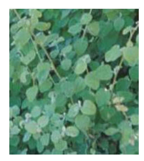
Figure 12. H. petiolare.

An extensive search of the literature revealed at least three documented studies investigating the toxicity of H. petiolare [40,84,85]. Lourens et al. [40] reported that the chloroform:methanol (1:1) extract of H. petiolare had toxic effects on glioblastoma (SF-268), transformed human kidney epithelial (Graham), and breast adenocarcinoma (MCF-7) cells at 0.1 mg/mL, showing 76%, 59%, and 33% activity, respectively. The work of Aladejana et al. [84] revealed that the whole plant ethanol extract of H. petiolare demonstrated significant toxicity in L6 myocytes cells and HepG2 (C3A) hepatocytes at 100 \mu g/mL concentration. Sagbo and Otang-Mbeng [85] in their toxicity assessment of the methanol extract of H petiolare also reported that the extract was toxic against B16F10 mouse melanoma cells and MeWo human melanoma cells in a dose-dependent manner. The same group [85] also reported the genotoxicity of the plant extract (methanol) against the Vero cell line at the highest three concentrations tested (50, 100, and 200 \mu g/mL).