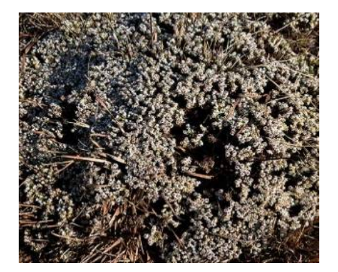
Figure 5. H. caespititium.

Helichrysum caespititium (Figure 5) is a perennial creeping plant of 10 to 20 cm in height. The leaves of the plant are linear, clutching at the base and hairy on both sides, while its flowers are white to yellow [41]. H. caespititium is broadly distributed in Lesotho, Zimbabwe, South Africa, and Swaziland [42]. In South Africa, the whole plant of H. caespititium is cooked and then used to alleviate diabetes mellitus [43]. Additionally, the plant is also used for the treatment of some medical conditions such as wounds, ulceration, skin infection diseases, nausea, tuberculosis, bronco-pneumonia, and sexually transmitted infections [27].