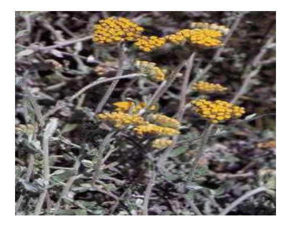
Figure 10. H. odoratissimum.

Malawi [69]. In South Africa, it is found in the Eastern Cape across the mountains and coastal areas. In traditional medicine, the infusion from the whole plant is taken orally to treat diabetes [66]. In Lesotho, the whole plant part is mixed with other plants as herbal medicine to treat backache [69].