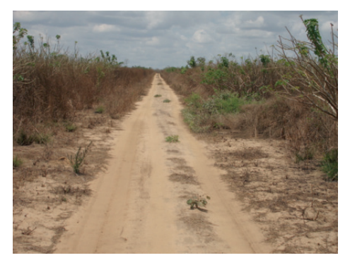
Figure 2: Sun biofuels jatropha farm

99 years. The company paid a compensation of US$324,000 of which the district council received 60 percent and villages earned a mere 40 percent.<sup>16</sup> This transaction is in violation of the Tanzania's Land Act No 5 and Village Land Act No 5 both of 1999, which recognize only a Village Assembly as the manager of the Village Land and the district council had no right to receive such a large share of the compensation. In addition, many countries' land laws do not consider the land value itself in compensation, but rather treat land via its additional development value such as planted trees, houses and other visible developments.<sup>17</sup>This treatment of value added of land contributes to undervaluing the true commercial value of land in many African countries.