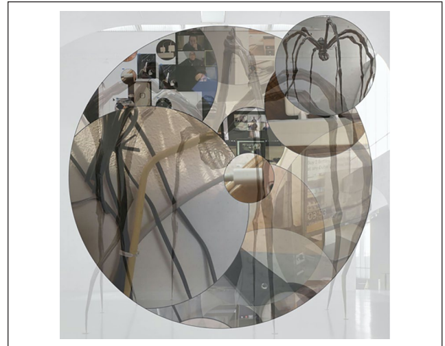
Figure 2. Of cables and webs. Note. Screenshot: Nike Romano.

Using Zoom's shared screen option and working in InDesign, our initial plan was to place images alongside one another in a series of squares that, much like a cottage window, would frame the various views. However, the rectilinear grid, that embodies the x and y binary logic of modernist thinking, felt like an imposing structure that would restrict our flow and commitment to the immanence of the specific material-discursive encounter (Krauss, 1979). Rather than setting up a Show & Tell scenario, we turned toward a more performative arrangement that enacted rather than represented our ongoing entangling web.