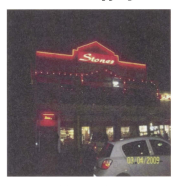
Plate 1: Club Stones, from the street

The venue for the performance of the cipha battle studied in this paper is Club Stones, located in the Northern Suburbs (Kuilsriver) of Cape Town. Like many other clubs, it is a safe haven for the practice of the culture, and on the other hand, a nexus of commercial exploitation. Regularly, on a Wednesday night between 20H00 and 02H00, Stones plays host to a gathering of youths comprising rappers, DJs and hip-hop fans who are there to enjoy the hip-hop show, "Stepping Stones to Hip-Hop" (see Plate 3). In 2008, a group called Suburban Menace, approached Club Stones's management in Kuilsriver and negotiated the hosting of a hip-hop show. A young group at that time, their main purpose was to gain experience performing in front of an audience in a club. One of the main features of their rapping was the performance of cipha.