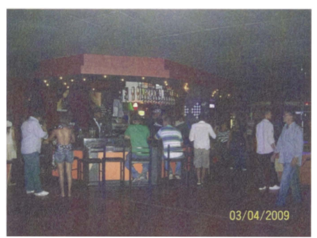
Plate 4: Main Bar with Staff

The staff employed by Club Stones is predominantly coloured and male (Plate 6). The audience and patrons who attend the hip-hop show are usually multilingual having at least Afrikaans and English. While most of the employees live in the historically coloured area cordoned off by the then Groups Area Act of apartheid, many of the audience members who frequently attend the hip-hop show on a Wednesday night are from areas beyond the community of Kuilsriver, travelling from as far afield as Mitchell's Plain, Bellville, central Cape Town, and even Johannesburg. Many visit Stones on a Wednesday night for cipha performances. As one young male hip-hop fan put it, "All I look for is good flow and punches, hate when rappers use the same shit in different battles. They should be disqualified and boohed."