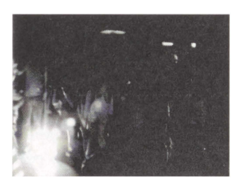
Plate 8: Audience members