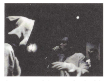
Plate 7: Keaton (left) versus Phoenix (right)