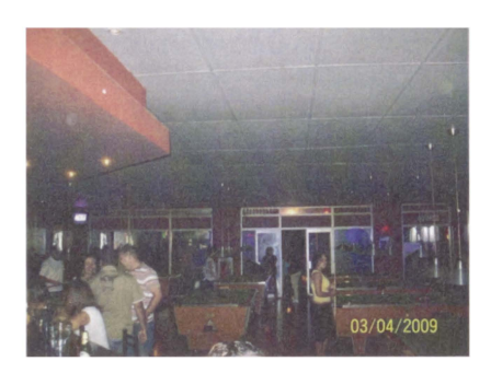
Plate 2: Pool tables