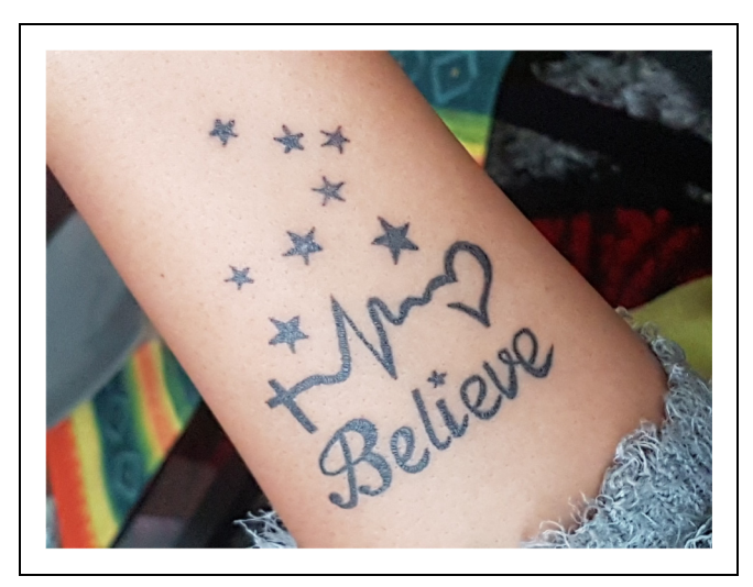
Figure 3. Kaya (girl, 16)-tattoo.