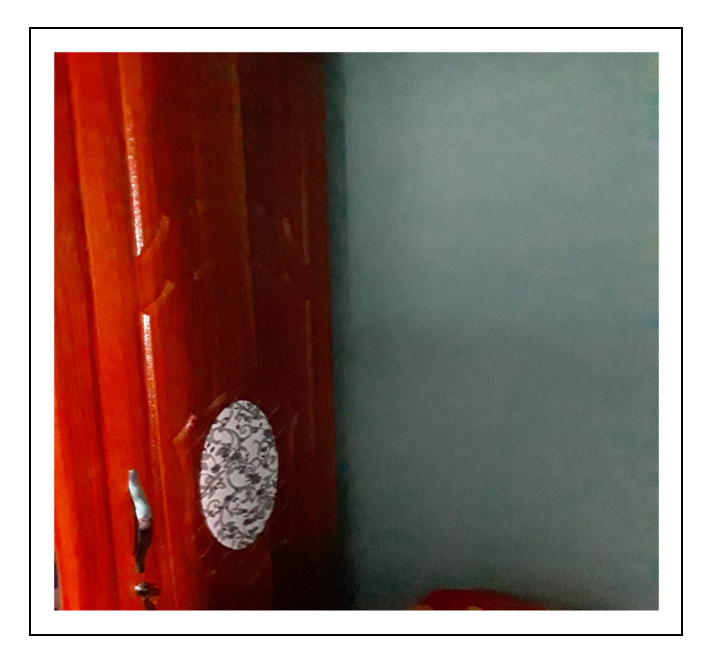
Figure 5. Amahle (girl, 17)—hiding in the closet.

Amahle also showed a picture of a closet she used to hide in to avoid taking her treatment when she was younger. For both Amahle and Emma, the resistance to taking their pills was based on the discomfort of the pills that are hard to swallow and becoming nauseous because of the bad taste it left in their mouths.