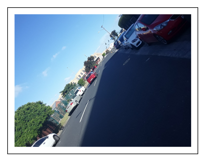
Figure 4. Sarah (girl, 17)-moving forward in life.