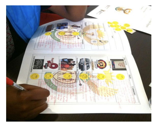
Figure 3. Health Clinic Report Card in Terms of for Example Staff, Services and Availability of Treatment.