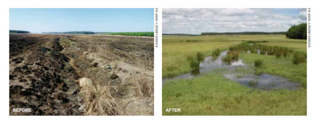
Figure 1: Illustrates the Zoar wetland before and after rehabilitation.