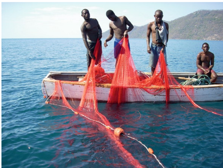
Fig. 12.3 A Chilimira seine being brought-in after a throw on Southeast Arm of Lake Malawi. Operated from two boats, the net is thrown in a wide semi-circle and then slowly pulled in a surround bagging motion from the two boats until the two boats come together. This photo shows one boat and one of the net ends

as a result of its use for catching the chambo. When the DoF discovered that fishers had invented kauni, the knee jerk reaction was to ban the method on the basis that the small mesh-sized 14 chilimira was catching undersized chambo. Fishers are adamant though that kauni does not catch undersized chambo, since most of the offshore chambo are adult.