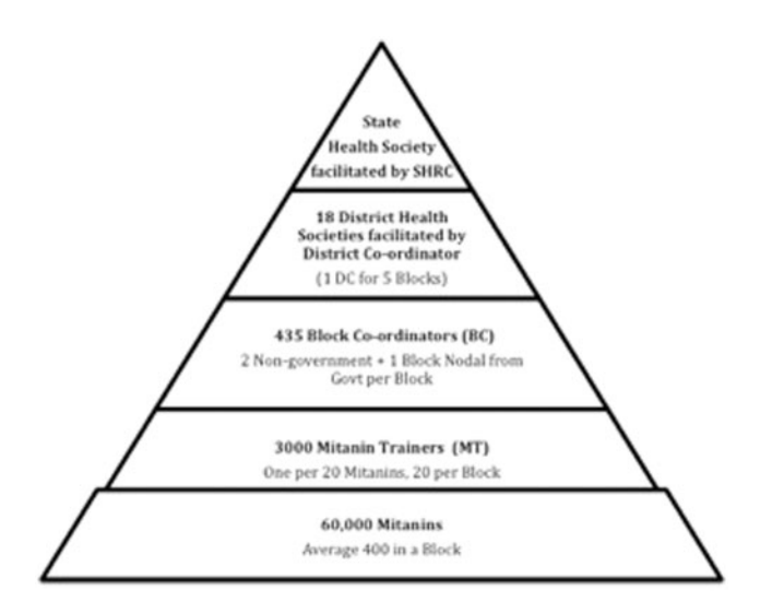
Figure 1 Mitanin programme structure.

The Mitanin Programme started in Manendragarh in 2002 during the first phase of the programme whereas in Durgkondal it was initiated in the second phase in 2003. In both blocks, the first step was for the block health officials to select the block co-ordinators. The block co-ordinators and the Auxiliary Nurse and Midwife (ANM) in turn selected women mobilizers who later became Mitanin trainers. The mobilizers conducted meetings in the villages and facilitated selection of Mitanins in consultation with the village councils. Folk media was also used for social mobilization around the programme. In both Durgkondal and Manendragarh, a large number of Mitanin trainers and block co-ordinators had been Mitanins previously.