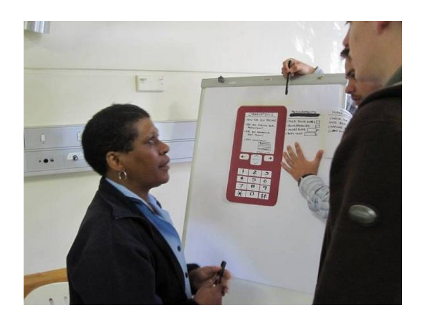
Designing the phone interface Figure 5, a caregiver co-designing the mobile phone interface

A lo-fi prototype, with a cardboard template of a mobile phone was used. Caregivers enjoyed this method that allowed them to provide input and give their preferences without them being confronted by technology. Figure 5 illustrates this method.