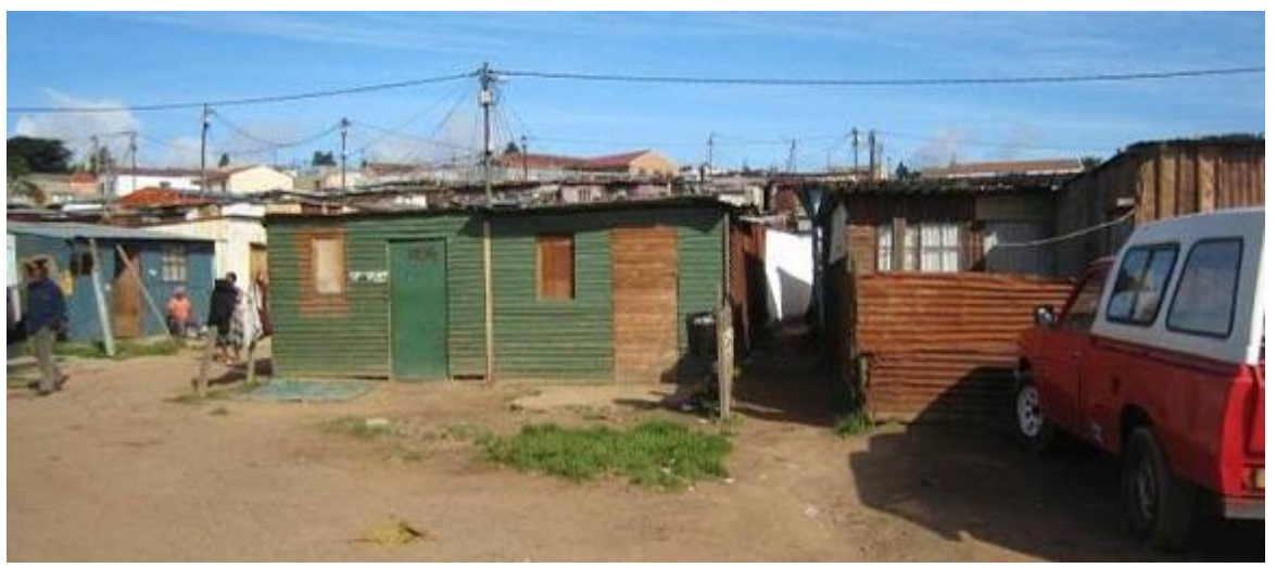
Township, Western Cape, SA Figure 1 - Township in the Western Cape, South Africa

The township community suffers from the socio-economic factors that influence the wellbeing of a community. There is a high incidence of HIV/AIDS and TB and the home-based care needs are typical of a poor community. The caregivers are citizens from the township who have received basic home-based care training. The hospice is responsible for the home-based care service to ten areas representing communities in a town in the Boland in the Western Cape, South Africa and its immediate surroundings. The township selected for the ethnographic study is one of the poorer areas. Figure 1 is a photo of the "homes" in the township.