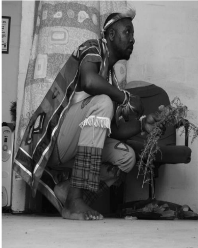
FIG. 3. Inyanga in Strand, Western Cape, with fresh plant.