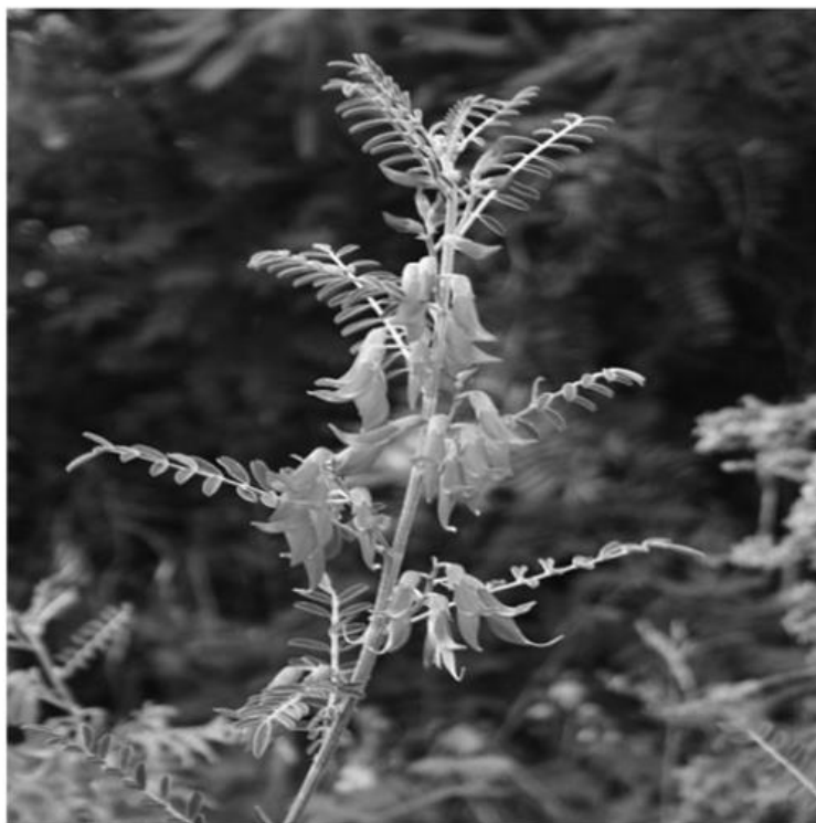
FIG. 2. Flowering Sutherlandia frutescens . (November 3, 2011).

botanical entity, its local uses and therapeutic properties, and the science related to ongoing phase IIa and IIb clinical trials.