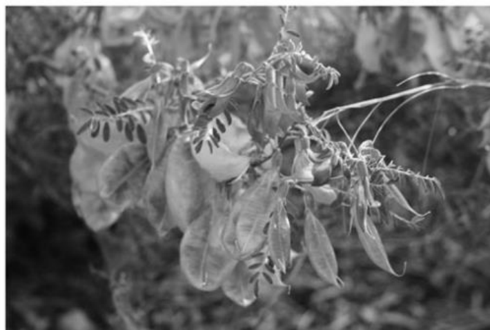
FIG. 1. Sutherlandia frutescens, showing seedpods and flowers.