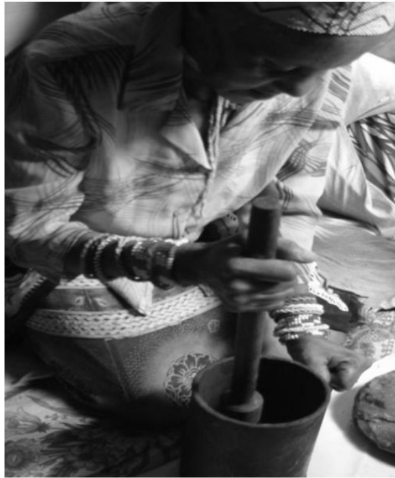
FIG. 5. Sangoma preparing dried Sutherlandia stems and leaves.