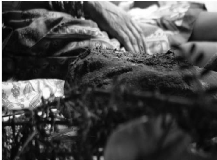
FIG. 4. Dried Sutherlandia frutescens plant material ground between stones.