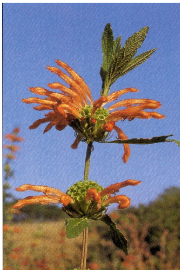
Figure 1: Leonotis leonurus (L.) R. Br. (With the permission of Frits van Oudtshoorn, Briza Publication)

minutes. The decoction is then cooled overnight, strained and used as a clean liquid for both internal and external use. The choice of an aqueous extraction procedure in this study was based on the above information from SATMERG (2003). This procedure was previously described by Veale et al. , 1989. The leaves were dried in a ventilated oven at a temperature not exceeding 35°C and then allowed to regain the air-dry state ( \pm 8\% moisture). The material was milled and the powder was passed through a sieve of mesh size of 850 \mu m. Boiling distilled water was added and the mixture was stirred and then strained through glass wool. The filtrate was freeze-dried (Freeze Mobile 12SL, Virtis Company, Gardiner, New York. 12525) for 24 hours using 200ml boiling distilled water to 5mg powdered material. The yield of extract was \pm 1\text{g}/5\text{g} powder.