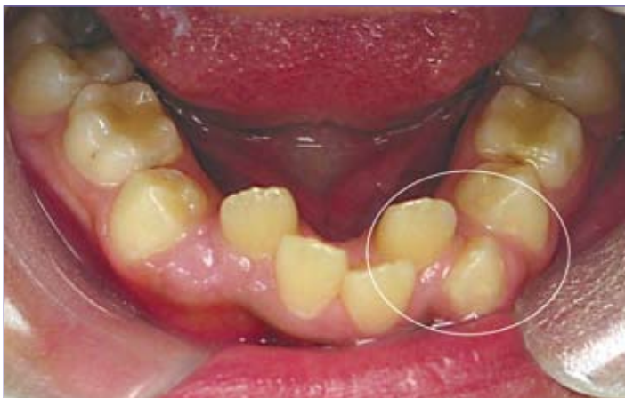
Figure 1: Tooth 33 exhibits mesial drift resulting from the lingually displaced lateral incisor. The unfavourable sequence of eruption on the right side where the first premolar has erupted prior to the mandibular canine should be noted. Untreated, the right side will eventually mirror the left side.

Aetiologically, a number of mixed dentition factors or events, if not intercepted, may lead to ectopia of the mandibular canine with a resulting malocclusion. These factors or events include: