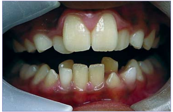
Figure 2: Mesiolingual rotation of tooth 32 and transposition of tooth 33 with the associated retained primary canine. There has been no transposition on the right side.

The only reported transposition pattern in the mandible involves the lateral incisors and canines. 15 Peck et al. , (1998) 9 described the early stage characteristics of transposing mandibular lateral incisors. The teeth exhibit distal tilting and are have a mesiolingual rotation of between 60 degrees and 120 degrees (Figure 2). The resulting lack of contact allows the canine to move mesially. Radiographically, the early stages are characterised by the switched positions of the crowns but not the roots (Figure 3). The transposed lateral incisor frequently precipitates resorption of the first primary molar leading to an early exfoliation. The treatment of this mandibular transposition is dependent on the timing of the diagnosis. 16 If the condition is diagnosed early, i.e. while the permanent canine is still low down in the alveolus, the situation can be intercepted using fixed appliances. 15 Once the permanent canine has erupted, the only practical treatment options that remain are extraction of one of the involved teeth or maintenance of the status quo by accepting the transposition. 15