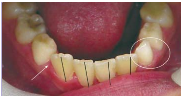
Figure 4: Unilateral early loss of the right primary canine (arrow) showing the resultant inclinations of the incisors and loss of space.

In all cases of bilateral spontaneous loss of the primary canines, the resultant buccal segment crowding will be determined by the sequence of eruption of the permanent canines and premolars, as well as by the degree of space shortage. Should the sequence of eruption be favourable, the canine has a greater chance of good alignment while the second premolar will most likely be blocked out (Figure 5). However, should the first premolar erupt