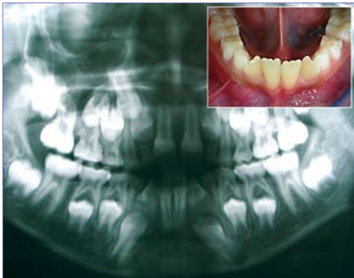
Figure 9: Panoramic radiograph illustrating a patient in the mixed dentition with rotated lateral incisors and canines showing an exaggerated mesial inclination (40 degrees).