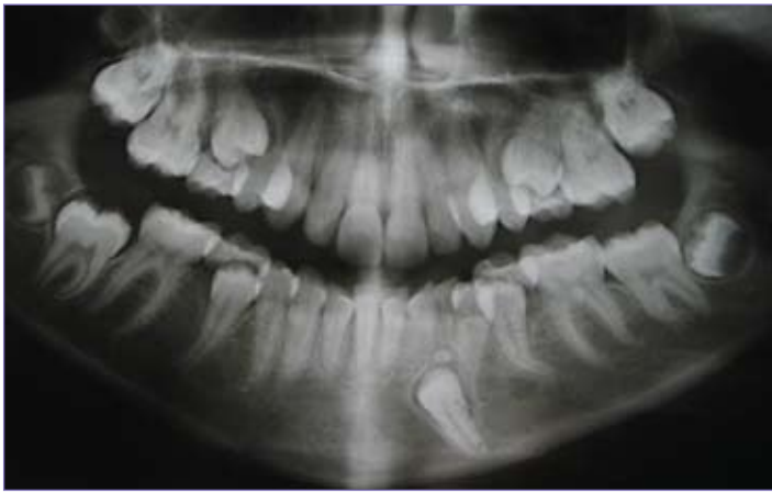
Figure 7: Tooth 33 is blocked out by an odontome and is angled at 36 degrees to the midline. Judging by the advanced stage of root formation, it no longer has the potential to transmigrate.