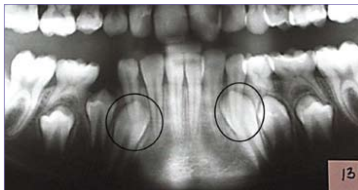
Figure 6: The roots of the primary canines are overlapping the crowns of the permanent canines. The enlarged size of the images of the permanent canines indicates the lingual eruption of those teeth. This anomaly of eruption will allow the first premolars to erupt prior to the permanent canines. The unfavourable sequence of eruption on the right side due to early loss of the first primary molar should be noted.

prior to the canine, the canine will be ectopic. In all these cases it is very important to assess the space situation in order to decide whether the situation can be intercepted or if comprehensive orthodontics is necessary.