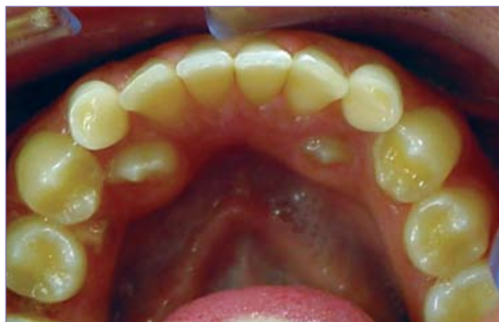
Figure 5: The permanent canines are blocked out of the arch as a result of the unfavourable sequence of eruption of the mandibular teeth and retention of deciduous canines. There is insufficient space in the arch for the permanent canines to self-align. (If the sequence of eruption is favourable, the canines should erupt prior to the premolars and in normal circumstances there would be sufficient space.)