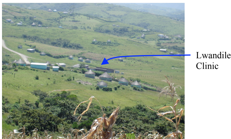
Figure 1. Rural environment in the Libode District Eastern Cape of South Africa

Villages are spread out for kilometres. Most homes are traditional rondavels constructed with a circular mud wall (now mixed with cement) and a thatch roof. Almost no one has electricity or running water. The Lwandile clinic is in the centre of the picture, behind the rondavels.