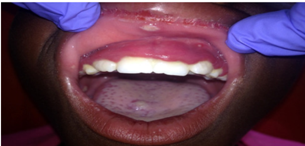
Figure 2 Inflammation of the marginal and attached gingivae.