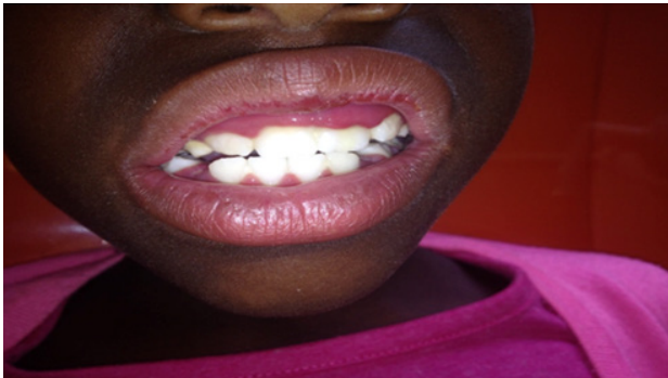
Figure 1 Upper labial mucosa surrounded by an erythematous area.