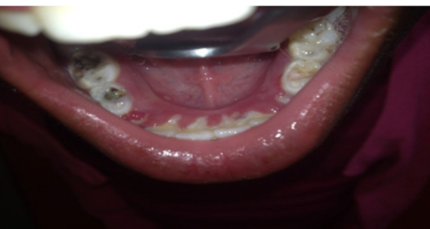
Figure 4 Multiple ulcers on lower gingival mucosa and floor of the mouth.