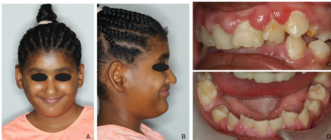
Fig. 1 – (A) Frontal view. (B) Lateral profile. (C) Lateral clinical views of the patient at initial examination showing shovel shaped teeth with enamel hypoplasia and inflammatory gingival hyperplasia. (D) Lower occlusal view.

The extra-oral examination revealed her face to be triangular in shape, although not so apparent, and full, bushy eyebrows. She had a prominent nasal bridge, a bulbous nose and a thin vermilion border of the upper lip. Lip tension is present. Her hair was coarse, and she presented with a low hairline (Fig. 1A and B).