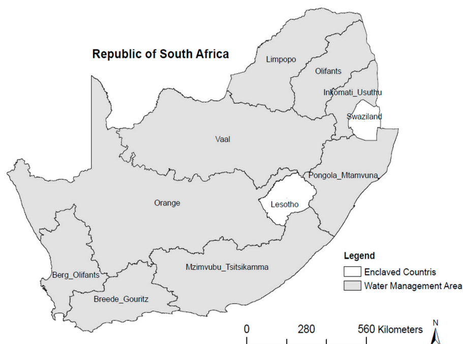
Figure 1. Map showing location of the study area.

Policy implementation for water resource protection in South Africa was chosen because such practice does not only ensure water availability and its sustainable use for current and future generations but also caters for environmental water requirements to sustain ecological ecosystems from which goods and services are derived to support socio-economic development, which is central to human wellbeing globally. The legislative framework in the country prescribes resource-directed measures as strategies for water resource protection to set minimum levels of environmental considerations [13,78]. This demonstrates the importance of resource-directed measures relevant and acceptable policy implementation strategies toward improved and integrated water resources management practice. However, the country is a developing state characterized by semi-arid conditions and climatic changes which has a direct influence on water resources availability with only the southwest region of the country that predominantly receives its total annual rainfall during the austral winter months (April–September) [79,80].