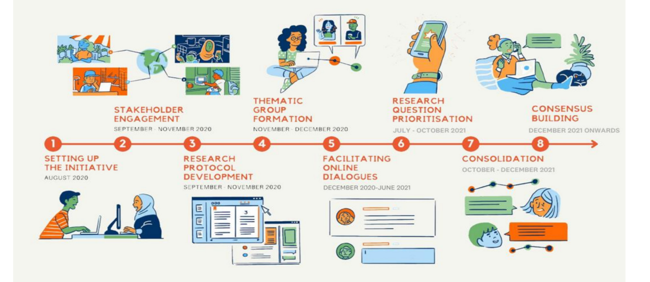
Figure 3 Trajectory of activities followed in developing shared gender and COVID-19 research priorities.