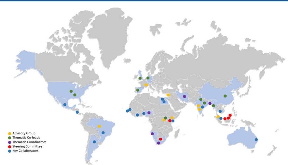
Figure 1 Geographical spread of leadership and key collaborators shaping a shared gender and COVID-19 research agenda.

emails sent to listservs and to individuals approached via steering committee members' networks. We had no fixed targets or quotas, but there was an emphasis on ensuring LMIC representation and engagement by stakeholders other than researchers. Visual maps posted in real time the characteristics of stakeholders who participated voluntarily and we used this to galvanise further engagement. At every stage, representation of participants was tracked, reviewed and acted on with the aim of supporting participation from groups that were less well represented in the process, whether from specific regions or key audiences such as implementers, policymakers and donors.