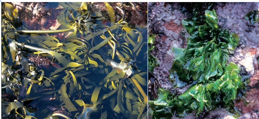
ABOVE LEFT: Ecologically, kelp provides an important complex, three-dimensional habitat for thousands of species of fish, invertebrates and other seaweeds. Kelp is also economically valuable to South African industries.

The commercial use of seaweeds in South Africa comprises but a small industry utilizing mostly brown and fleshy red seaweeds. The increasing use of local representatives of seaweeds has resulted in a state policy to ensure the sustainable use of these commercial resources and this awareness has greatly facilitated research on local seaweeds and considerably increased our knowledge of most of the species. It is only with this increased awareness that we've been able to bring to you the knowledge that we've gained regarding this fascinating group of marine organisms. 🌿