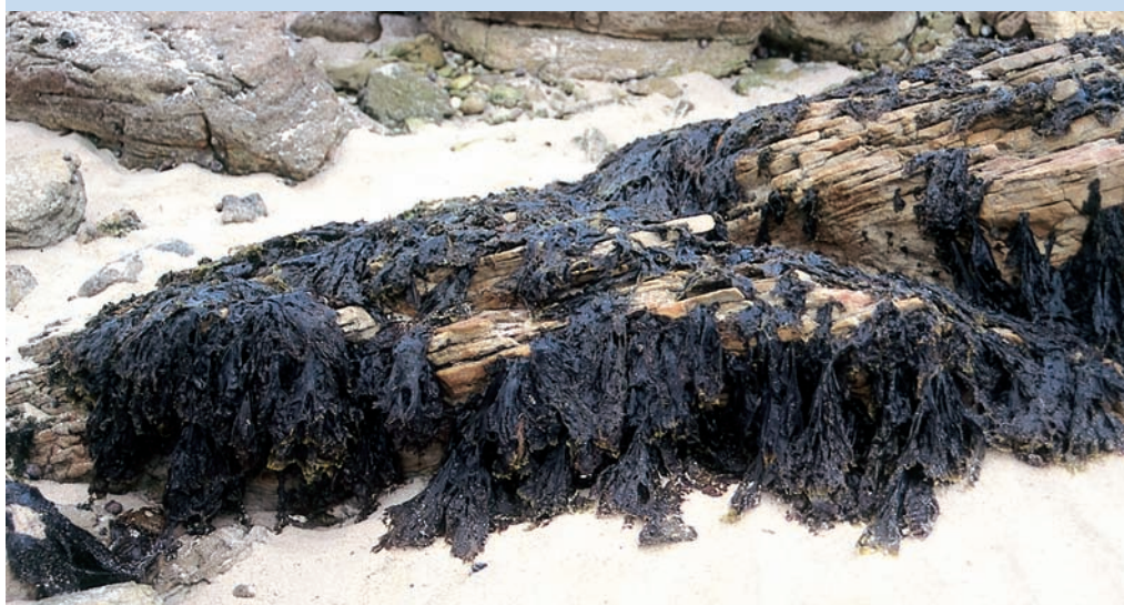
BELOW: Looking like wrinkled cellophane, Porphyra species are extremely low in calories and contain lots of iodine, which is good for healthy thyroid function.