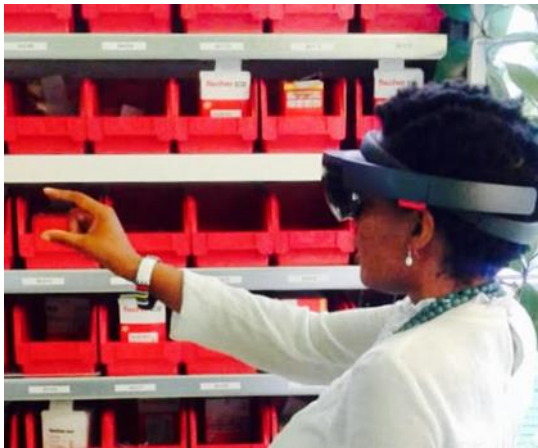
Figure 1. Microsoft HoloLens providing an augmented view of nails

Augmented and virtual reality technologies are immersive technologies which can provide real as well as virtual immersive experiences. These technologies can be accessed either through electronic devices such as mobile phones, head mounted gear or a Cave Automatic Virtual Environment (CAVE). There are various companies which manufacture AR and VR hardware platforms as well as various software companies which develop accompanying software to be used on the various hardware platforms. A CAVE is a dark room which enables people to wear AR glasses and be fully immersed in the virtual world with the dark room adding an extra effect to this virtual setting [7]. Augmented Reality (AR) is the use of mobile technologies used to overlap a real world environment by visually superimposing and connecting a present view with virtual objects ([1]; [2]). In figure 1, the Microsoft HoloLens augmented reality glasses are used to supersede reality by creating a view which allows the participant to virtually move nails from one container to the other. In this image, the student is playing an educational game which requires them to pick and place virtual nails superimposed or visible on the real nail storage boxes.