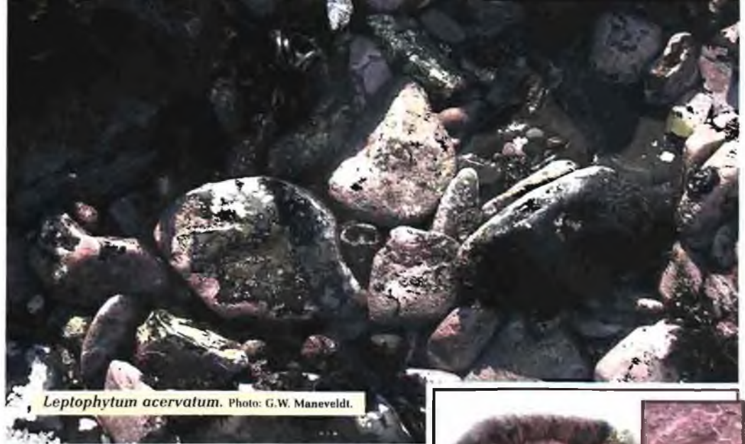
Leptophytum acervatum .

Information about the authors and how to contact them can be found on page 125 in the September 2000 issue of Veld & Flora . Visit their website at www.botany.uwc.ac.za/clines/ .