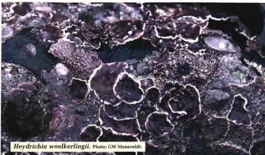
Heydrichia woelkerlingii .

By far the most abundant encrusting coralline alga within the immediate subtidal is HEYDRICHIA WOELKERLINGII (3). Named after two coralline taxonomists, H. woelkerlingii is an extremely thick (up to 20 mm), smooth, porcelain-like encrusting coralline with individuals easily attaining the diameter of a dinner plate. For this reason, it has been referred to as the 'dinner plate coralline' because to local divers, they look just like large glazed plates strewn across the subtidal floor. It is also called the velvety coralline crust because of its smooth velvety appearance, which can be seen clearly in the photo (left).