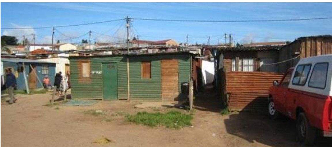
Township, Western Cape, SA

The township community suffers from the socio-economic factors that influence the wellbeing of a community. There is a high incidence of HIV/AIDS and TB and the home-based care needs are typical of a poor community. The caregivers are citizens from the township who have received basic home-based care training. The hospice is responsible for the home-based care service to ten areas representing communities in a town in the Boland in the Western Cape, South Africa and its immediate surroundings. The township selected for the ethnographic study is one of the poorer areas. Figure 1 is a photo of the "homes" in the township.