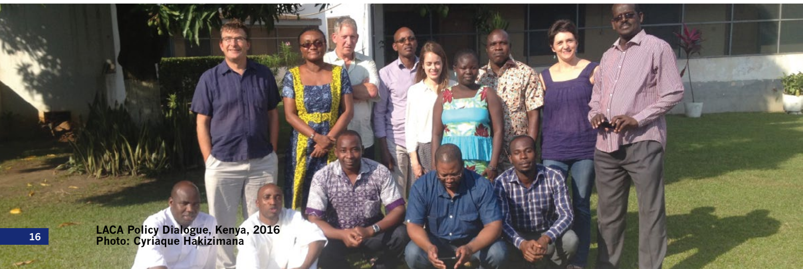
LACA Policy Dialogue, Kenya, 2016

PLAAS researchers and students presented well-received papers on aspects of agrarian change at two major international conferences in 2016 and 2017, held in Beijing and Moscow respectively. These were held under the auspices of the BRICS Initiative in Critical Agrarian Studies (BICAS) and were co-convened by PLAAS along with universities in China, Brazil, Russia and the Netherlands, as well as the Transnational Institute.