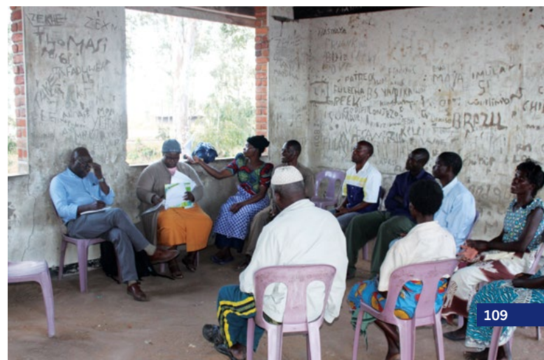
PLAAS researchers in the field