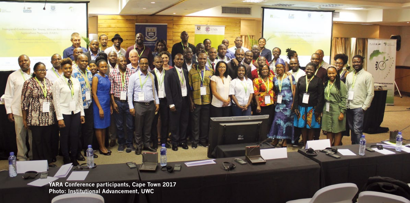
YARA Conference participants, Cape Town 2017