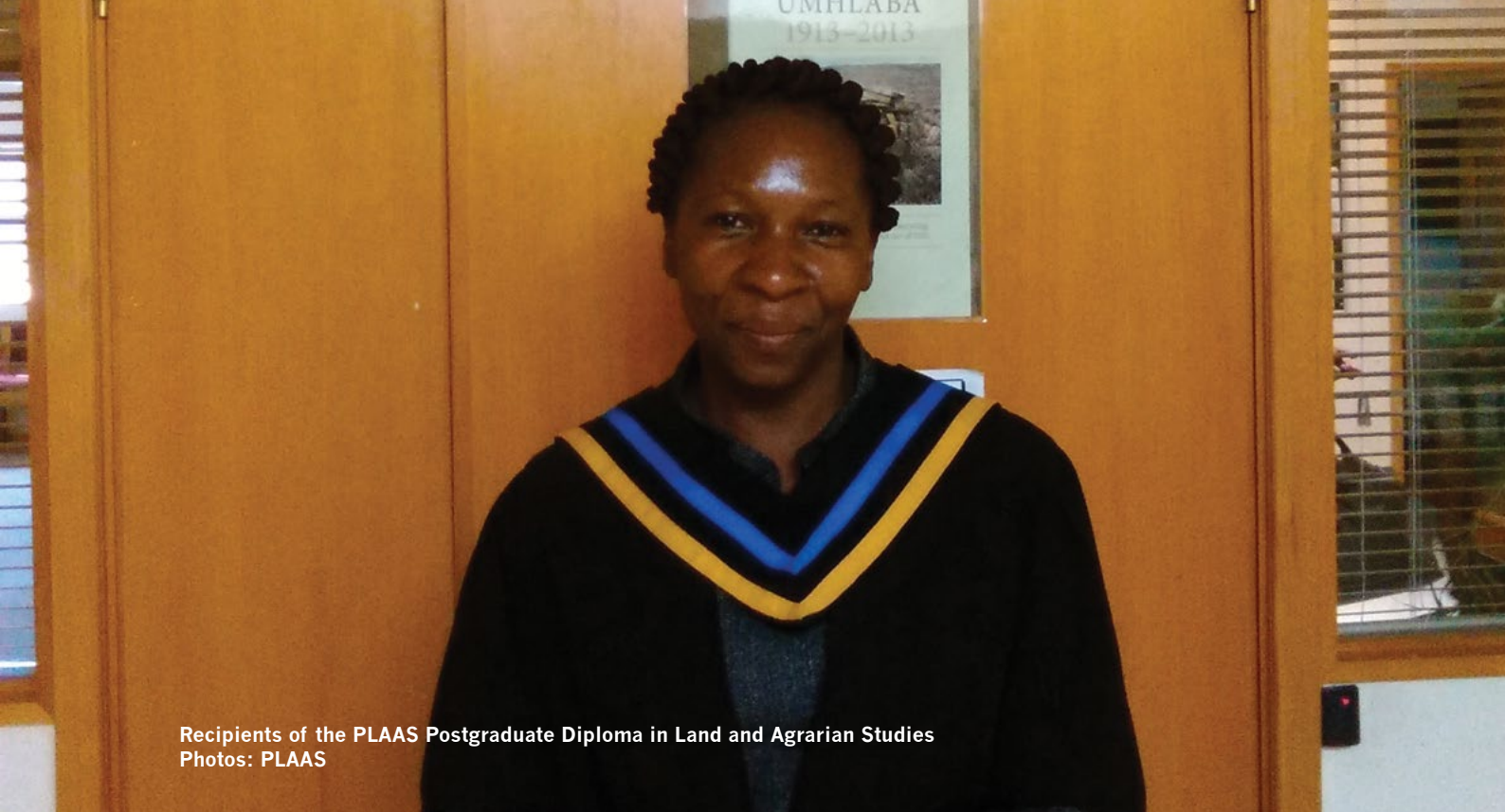
Recipients of the PLAAS Postgraduate Diploma in Land and Agrarian Studies