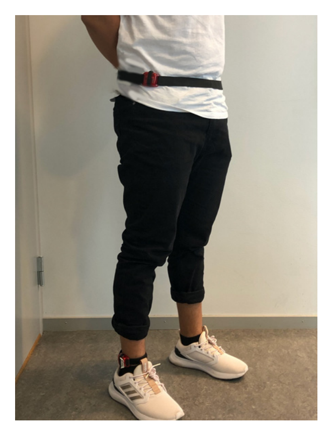
Figure 1. ActiGraph positioned around the right waist (above the iliac crest) and right ankle (proximal to the lateral malleolus).