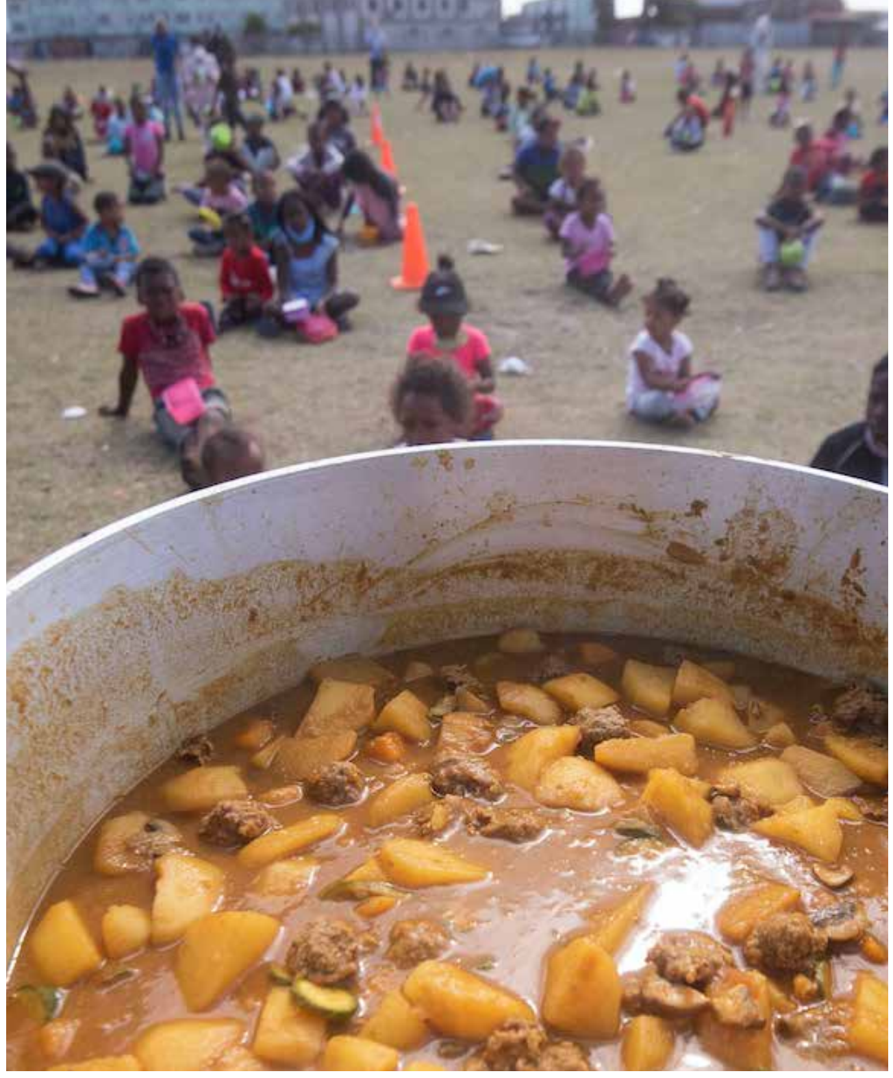
Children wait for food in Lavender Hill during the Covid-19 lockdown in Cape Town.

a report based on case studies which reflect the lives, experiences and support systems of twelve children and their caregivers in the Western Cape during 2021, in order to inform advocacy work regarding the link between the current Child Support Grant provided to South Africans and the required levels of nutrition for children to thrive.