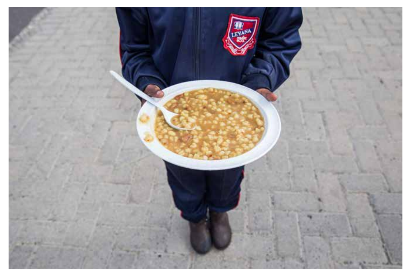
Children at Levana Primary in Lavender Hill, Cape Town.

or domestic workers, and working for the Community Works Programme. Caregivers' options are very limited, as are those of other adult members of their household - including the fathers of children receiving CSGs.