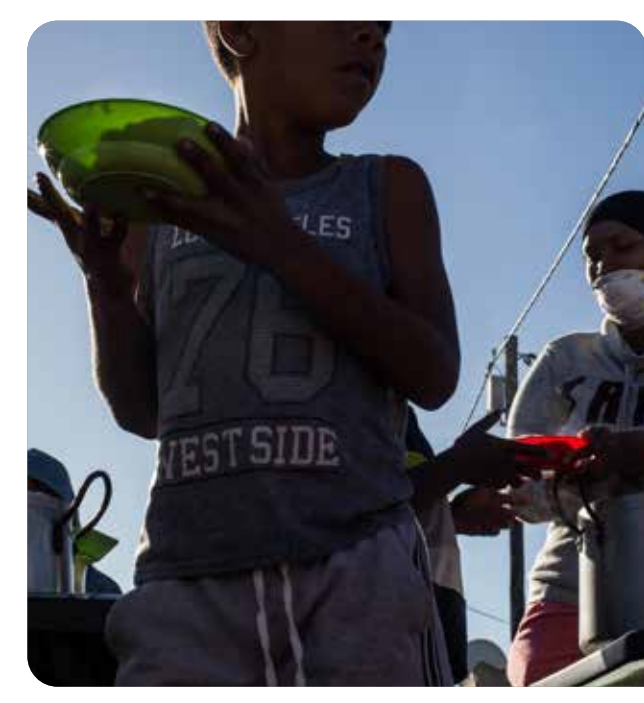
Feeding scheme in Wolwerivier.

one meal a day when they were short of food, which played a crucial role in providing families with a reliable, predictable source of cooked food and, in some cases, food parcels.