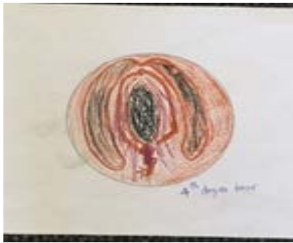
Figure 3: Site of obstetrics violence