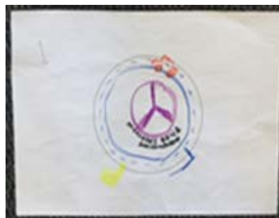
Figure 2: Speeding to catch deliveries

In Figure 1 the student first acknowledged the central joy of birthing. However, this was suppressed by the darker curricular imperative for 15 deliveries and other deliverables of the designed curriculum. The drawing demonstrates how the students' agenda and desire to achieve the required sign-offs (the curricular imperative for accountability and a prerequisite for progress to the next stage in the curriculum) became a noose-like constraint that restricted this student's response to unjust practices – a thread of tension arising from other drawings and workshop conversations.