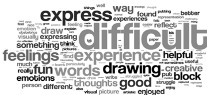
Figure 5: Word cloud representing student feedback on drawing task

Figure 3 was created in class by her kind colleague, assisting her by drawing a perineum with a 4th degree tear – an avoidable complication caused by the limited expertise and apparent lack of compassion of the midwife. Later in our focus group this student confronted a large sheet of A0 paper and, with marked determination and desire, added her sketch – with the events unfolding and becoming visible through the force of the coloured markers which connected with the paper through images and annotations, as indicated in Figure 4. Through email communication and also at a chance meetup in a shopping mall, this student thanked me for the opportunity to share and unload her burden. She wrote ‘it’s good that there are people like you who actually take time to figure out issues that can be resolved’ (email communication September 2015).