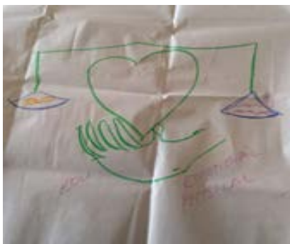
Figure 9: Seeking balance

Figure 9 drawn by a midwife educator illustrates the challenge of a socially just pedagogy in finding a balance between issues of the soul with the provision of information and skills (interview midwife 2015). This questioning is also put forward by Lenz Taguchi and Palmer (2014, 770) who ask ‘[h]ow can we be productive of positive desire in the production of knowing?’.