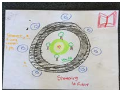
Figure 1: Curricular constraints

In terms of curricular tensions, the drawings in Figures 1 and 2 emerged from students' thinking during a classroom workshop (then explained by the students during a focus group a few weeks later). These drawings provide a small sample of the material-discursive intra-actions that constitute students' learning experiences in their journey to becoming doctors.