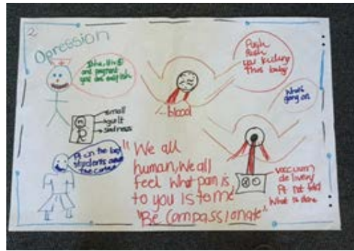
Figure 4: Multiplicity of pain felt by student

Figure 3 was created in class by her kind colleague, assisting her by drawing a perineum with a 4th degree tear – an avoidable complication caused by the limited expertise and apparent lack of compassion of the midwife. Later in our focus group this student confronted a large sheet of A0 paper and, with marked determination and desire, added her sketch – with the events unfolding and becoming visible through the force of the coloured markers which connected with the paper through images and annotations, as indicated in Figure 4. Through email communication and also at a chance meetup in a shopping mall, this student thanked me for the opportunity to share and unload her burden. She wrote ‘it’s good that there are people like you who actually take time to figure out issues that can be resolved’ (email communication September 2015).