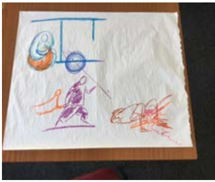
Figure 7: Exercise ball generating comfort compared to pain in forced positioning

Figure 7 shows the drawing created by a final year student in my interview with her as she reflected on her memories from two years earlier. An exercise ball was the first item appearing on the sheet of paper. She explained how these balls ease the pain of women in labour by helping them move into different positions and by a rocking motion. The drawing compared one birthing facility where this student felt positive energy to another where she felt strong negativity associated with great discomfort and disgust. The fresh, brightly painted blue walls that provided an intensity of calmness contrasted with a bed holding down a woman in labour. This static positioning appears to be objectifying and pulling apart the mother-to-be. The student explained ‘that’s her head down here somewhere, that’s her arm closing her eyes’. Blood exploded and pain erupted. This student felt moved by what ought not to happen. She wished she could rather be alongside a caring and confident midwife saying ‘I would like to be in the shadow of a good role model’.