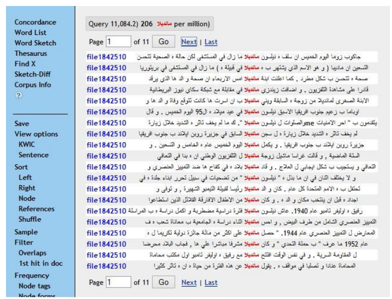
Figure 1. A snapshot of the concordance of the word Māndila in the corpus

collocations and concordances that can shed some light on the ideology of Aljazeera . A snapshot of our corpus is given below.