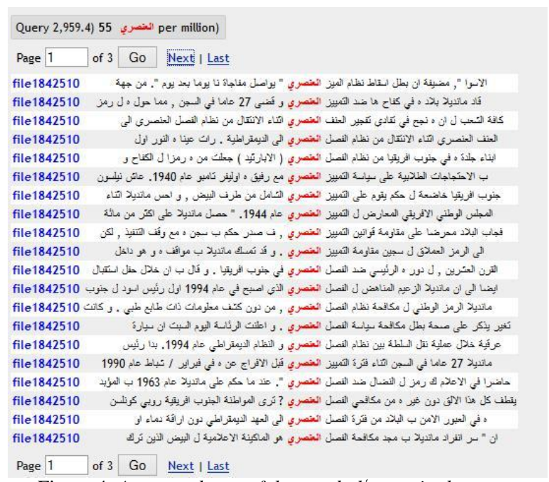
Figure 4. A concordance of the word al unsrī in the corpus

The Apartheid regime has also presented as a participant of powerful position and lexical items with different negative connotations have been attributed to it. The word sketch of niḍām "regime" in the corpus shows that the word collocates with alfaṣl "segregation" 18 times, diktātori "dictator" once, al-ʿunṣirī "racist" 24 times, al-tamyī z "discrimination" 4 times, and al-aparathied "the Apartheid" 4 times. All in all, al-ʿunṣeri "racist" has been repeated 55 times in the corpus as we can see in the following snapshot.