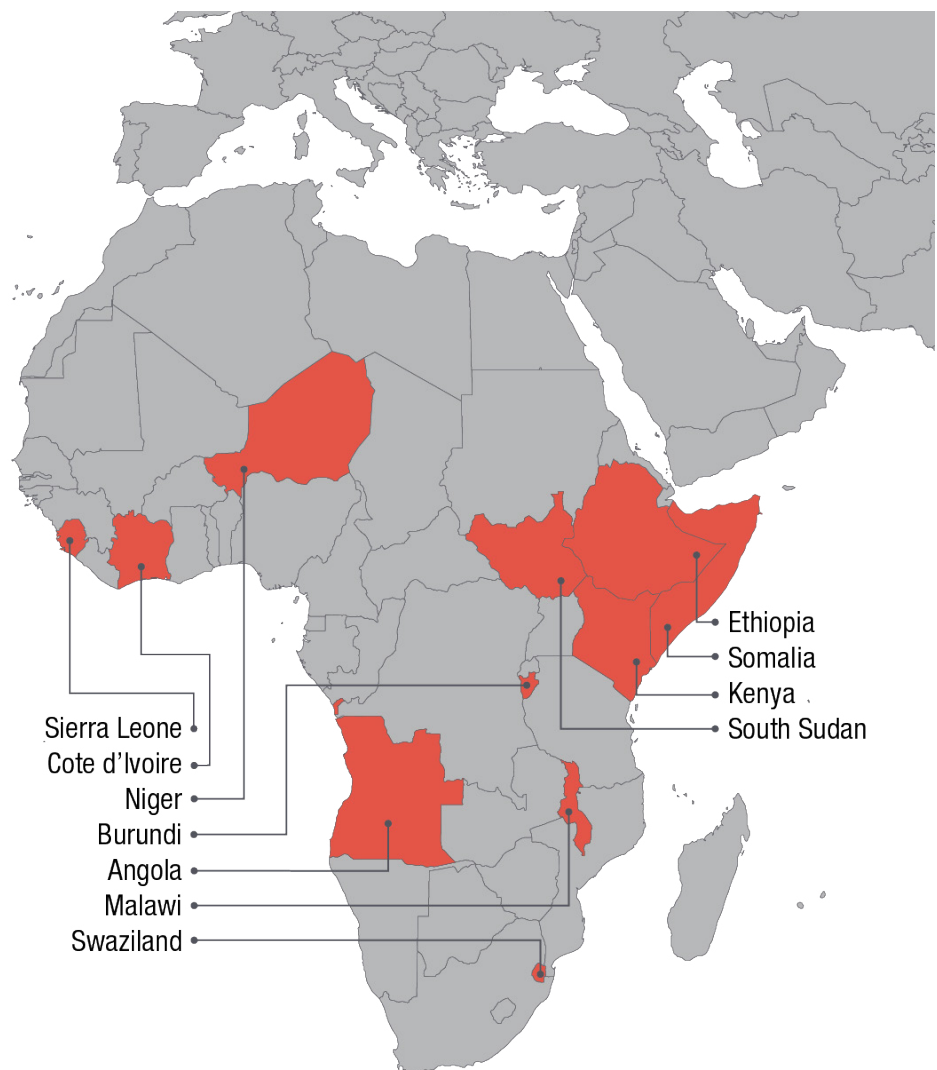
Map 2: Country programmes in Africa

as priorities for joint implementation of the VGGT and the F&G with support from the EU: Angola, Burundi, Côte d'Ivoire, Ethiopia, Kenya, Malawi, Niger, Somalia, South Sudan and Swaziland (see Map 2). These are to be the focus of capacity development on land governance; knowledge-sharing and exchanges among the countries; and support in the design of M&E systems. Lessons learnt from these country partnerships are to be fed into pan-African initiatives. A next phase of the transversal programme will extend to five new countries, focusing not only on land: Cameroon (forests), Ghana (fisheries), Guinea Bissau, Sudan and Uganda (Larbi, 2016).