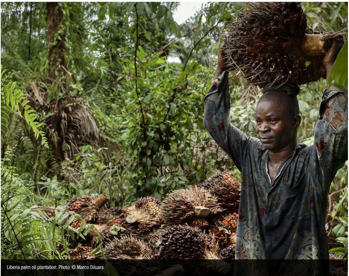
Liberia palm oil plantation.

Donors, multilateral institutions and financial institutions have developed a range of guidance products that apply the VGGT to various actors and sectors. These include resources to guide private sector investment and agricultural value chains, including the Organisation for Economic Co-operation and Development (OECD) guidelines promoted at the OECD Global Forum on Responsible Business Conduct in June 2015 in Paris. In addition, the World Bank and IFC have endorsed the VGGT and are in the process of integrating its provisions into their 'safeguards' policies, including on involuntary resettlement. The UN Committee on the Elimination of Discrimination against Women has also entrenched the VGGT principle of gender equality in a 'general recommendation' on the right of rural women, which uses the VGGT as a standard for gender mainstreaming and gives assistance on how states must address gender issues in all agricultural and rural development.