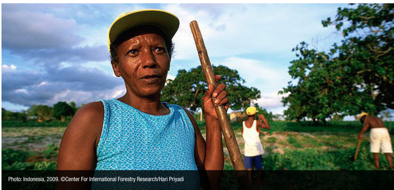
Photo: Indonesia, 2009. ©Center For International Forestry Research/Hari Priyadi

The past year has also seen the emergence of new evidence confirming that women are often more adversely affected than menfolk by large-scale land acquisitions. As women have fewer rights over land, and are afforded a lesser role in decision-making in many of the communities that large-scale land acquisitions target, they are less likely to be invited to participate in discussions that determine how land transfers unfurl or to benefit from so-called inclusive projects. The land they depend on is thus less likely to be exempted from transfer. Commonly overlooked as sources of women's (and community) food and economic assets are common lands such as forests, which are often more eagerly transferred than farmlands, which are often male-controlled.