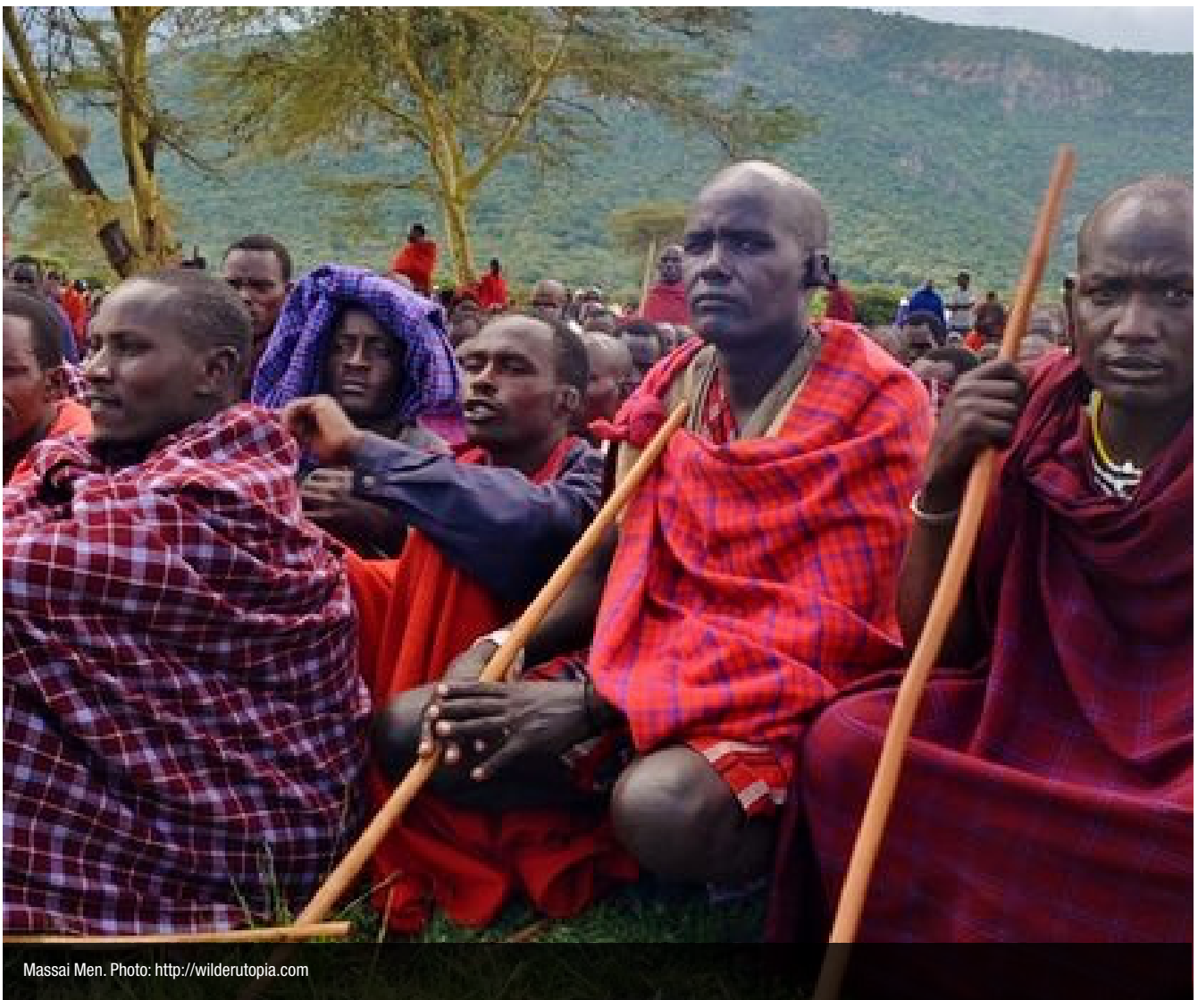
Massai Men.

What then are the main strategies and methods that various institutions have used to implement the VGGT and to make progress towards compliance by states and investors? In the next sections, we discuss five main categories of activity: awareness-raising; capacity-building; national programmes; regional programmes; and M&E.