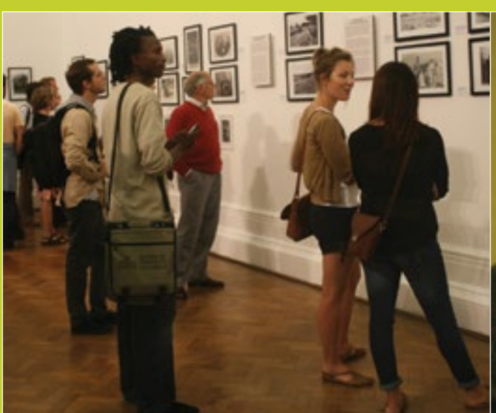
The Umhlaba Wethu exhibition at the Iziko National Gallery.