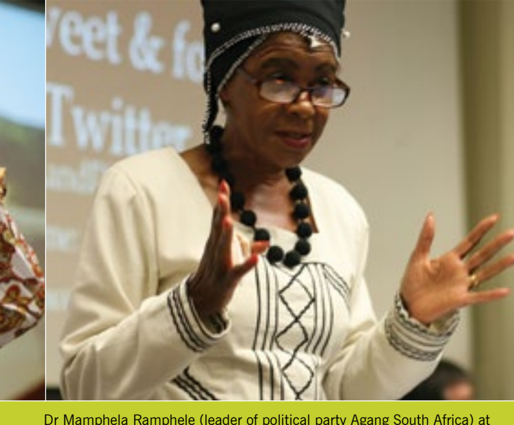
Dr Mamphela Ramphele (leader of political party Agang South Africa) at Commemorating the 1913 Land Act.