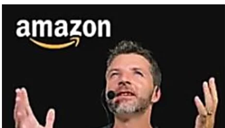
How to get a second income by investing