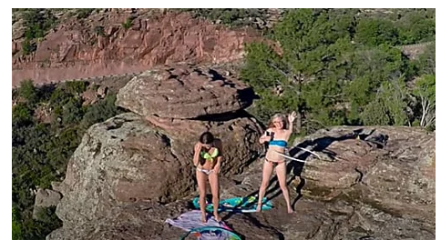
30 Captivating Drone Images Show