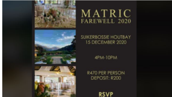
Mom who organised a matric dance ball for 50 shocked after invite for intimate event goes viral