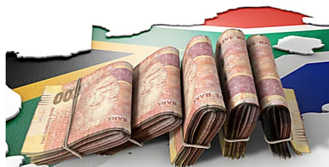
Cape Town: How to get an income by investing