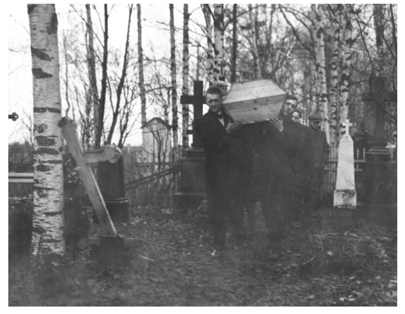
How viruses evolve

Funeral for a US soldier who died of influenza in Russia in 1919. The 1918-1920 pandemic killed an estimated 50 million people worldwide.