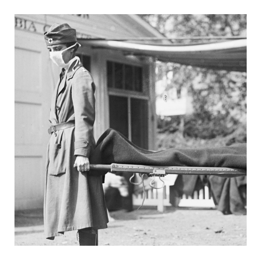
Pandemics — disease outbreaks of global reach — have visited humanity many times. Here are examples.

But making the jump from one species to another isn't easy, because successful viruses have to be tightly adapted to their hosts. To get into a host cell, a molecule on the virus's surface has to match a receptor on the outside of the cell, like a key fitting into a lock. Once inside the cell, the virus has to evade the cell's immune defenses and then commandeer the appropriate parts of the host's biochemistry to churn out new viruses. Any or all of these factors are likely to differ from one host species to another, so viruses will need to change genetically — that is, evolve — in order to set up shop in a new animal.