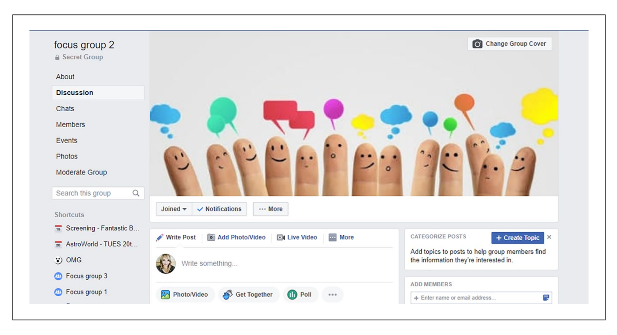
Figure 3. Example of the SFFGs home screen.

which everyone could try to be online. To facilitate the discussion, a question was posted from a preliminary interview schedule a few minutes before the agreed time. Other questions came forth based on the points raised by the participants. At the end of the week, we posted a farewell message and encouraged participants to raise any other questions they may have. The participants were informed that the SFFG would remain open, so that, we may present them with feedback from the study.