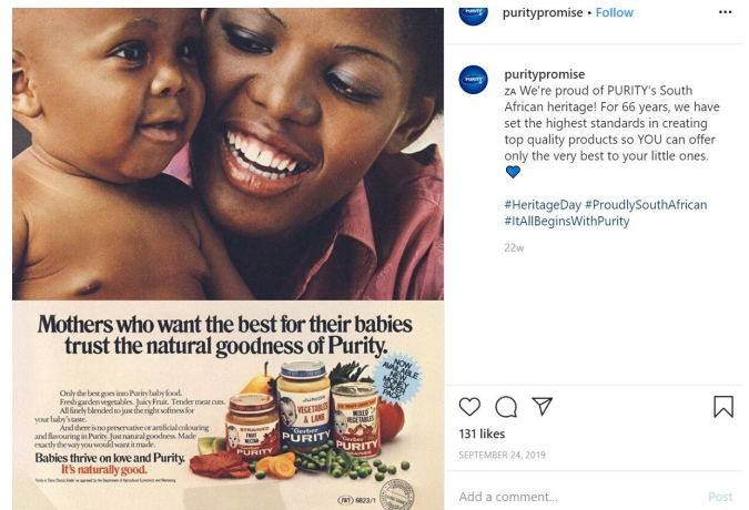
Figure 2 Example of an Instagram post from purity that violates provisions 2 (1) and 3 of the SA regulation R991. 30 SA, South Africa.

Provision 7 (1) of the Regulation R991 states that 'No person shall undertake or participate in any promotional practice in respect of (BMS); 7 (2) Promotional practices or devices in respect of the products listed in sub-regulation 7 (1) include, but are not limited to: ... Direct/indirect contact between company personnel and members of the public in furtherance of or for the purpose of promoting the [BMS-related] business of the company... ; Indirect contact includes internet sites hosted on behalf of an SA entity, television and radio, telephone or internet help lines, mother and baby clubs but excludes contact w.r.t. product quality complaints...'. 2 By inviting mothers to join a conversation on an instant messaging platform (WhatsApp), a BMS manufacturer (Nestlé) is clearly inviting direct/indirect contact between their company's personnel and members of the public (in this case, it clearly states 'moms'). According to Provisions 7 (1) and 7 (2), this should not be allowed to take place. The example described is, therefore, a direct violation of the SA Regulation R991. This type of practice takes place regularly by this BMS manufacturer