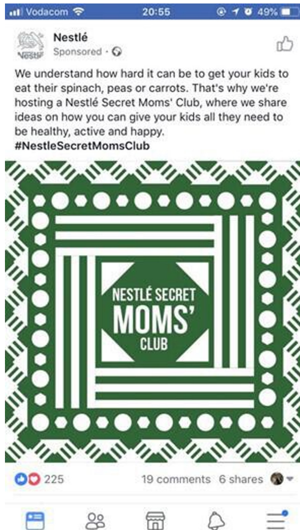
Figure 4 Example of a Facebook post by a Nestlé Facebook page that violates provision 7 (5) of the regulation R991. 31

The above example ( figure 3 ) is a direct violation of Regulation R991, as no companies can provide information to the public on IYCN. This is covered in Provision 7 (5) which states the following: 7 (5) No manufacturer,