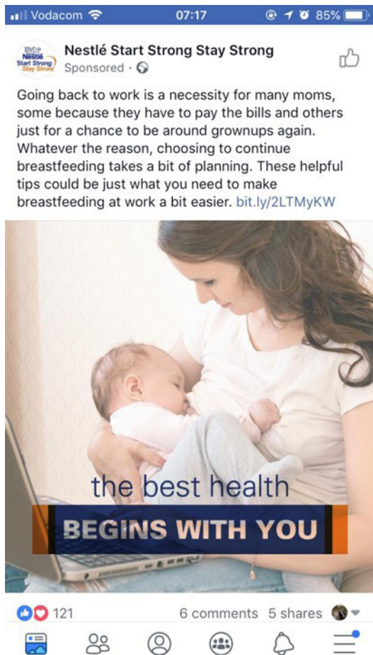
Figure 3 Example of a Facebook post by a Nestlé Facebook page that violates provision 7 (5) of the regulation R991.

to be appropriate for infants under the age of 6 months, which contravenes this provision.