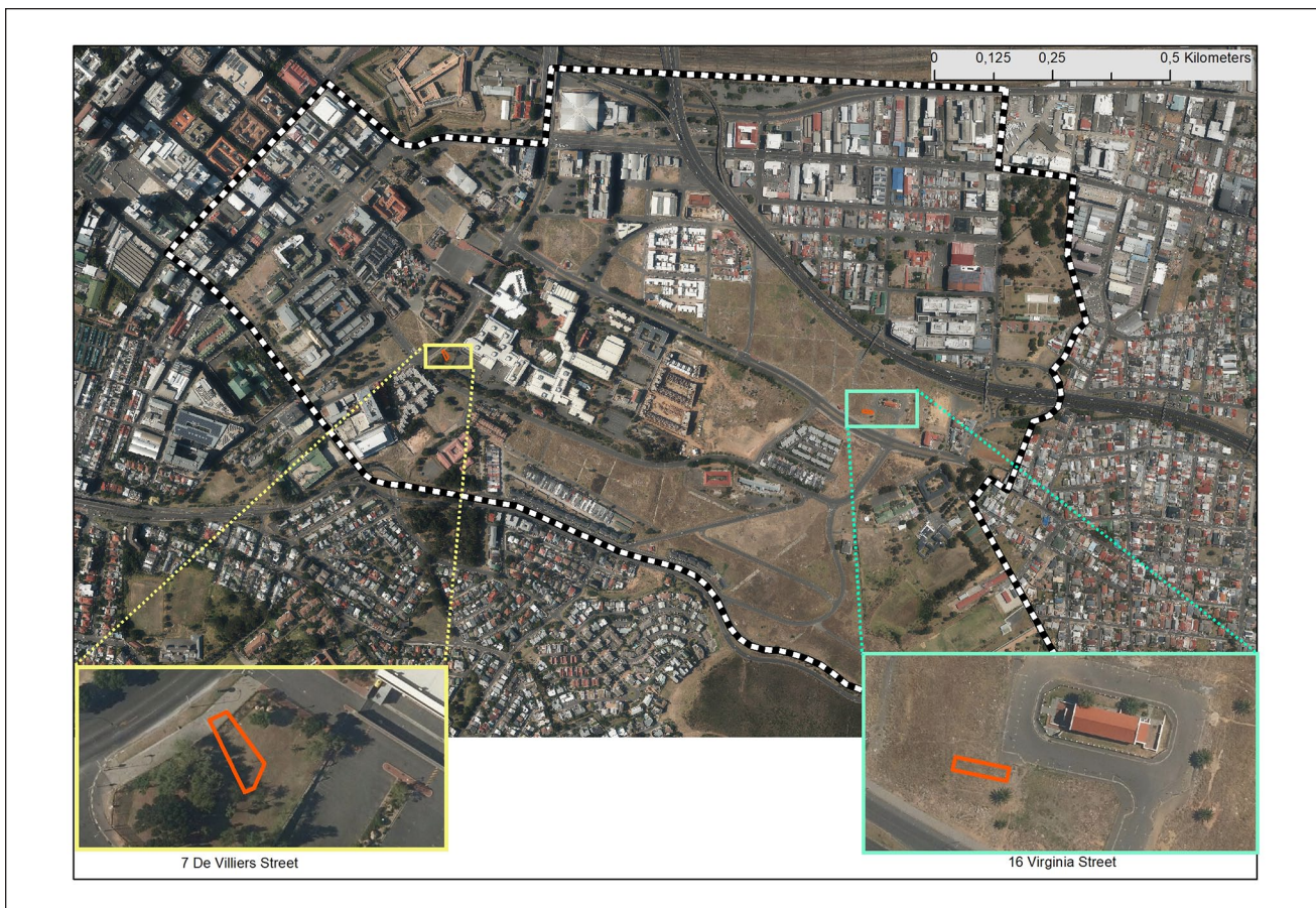
Figure 1. District Six, 2019.

were destroyed is shown. The inset map on the left shows the location of 7 De Villiers Street, and the inset map on the right shows the location of 16 Virginia Street. Both these “houses” were visited during walks that we report on here.