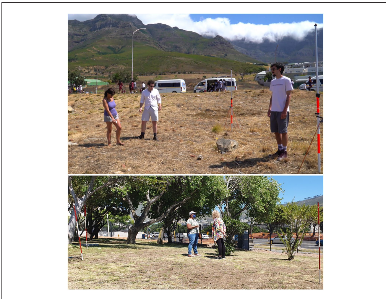
Figure 3. The sites of 16 Virginia street (top) and 7 De Villiers street (bottom).

removals haunt this tree, as it haunts the landscape, and it threads together a series of times before, during, and after demolitions.