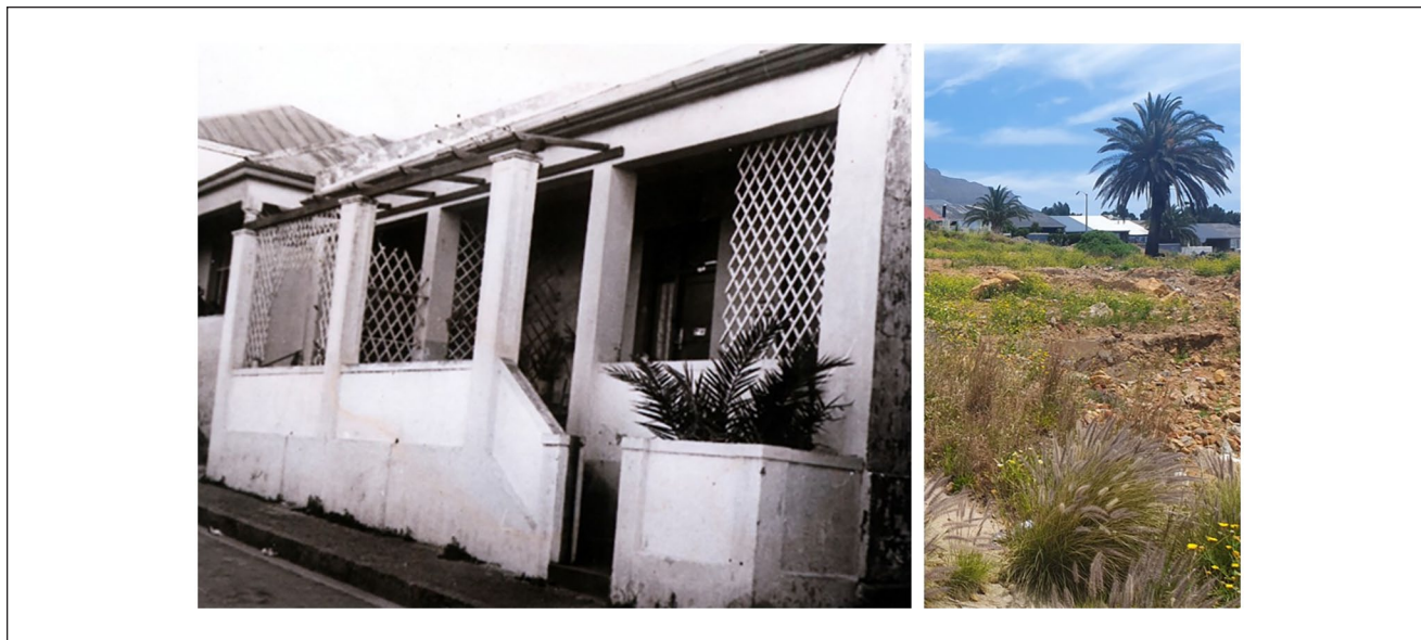
Figure 4. The Tree of Remembrance in the 1950s (left) and today (right).

Note. Left image credit: Suleiman Christians, District Six Museum Archive.