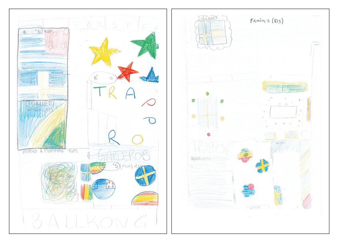
Figure 2: Feven's space-mapping portrait from family 3.

monolingual and multilingual language practices. Accordingly, the spacemapping data and the follow-up oral narration revealed a rich description of language use by family members in various common spaces and private rooms, particularly the language use pattern in parent-child interaction between children, language use at the individual level, and language choices in the presence of guests and visiting friends. Figure 2 shows one instance from the children's space-mapping portraits, and an excerpt from the post-mapping narration is presented below the figure.