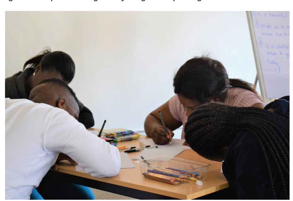
Figure 2: Participants in the digital storytelling workshop making illustrations for their stories