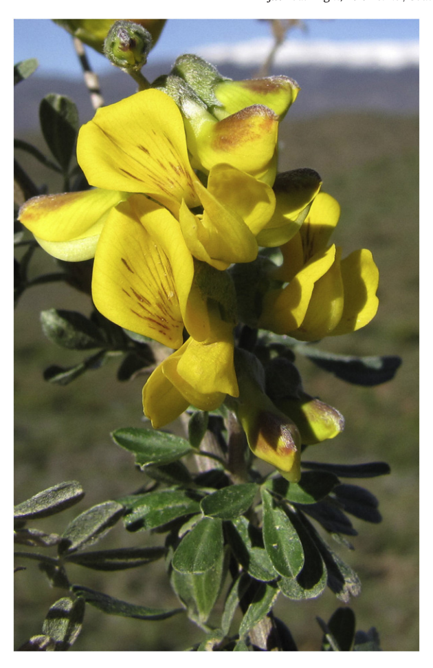
Fig. 1. Flowers and leaves of Wiborgiella argentea.

caducous; bracteoles linear, 1.0–1.5 mm long, sericeous, caducous. Flowers 10–12 mm long, yellow, with brown streaks on inner surface of standard. Calyx \pm 4 –5 mm long, densely pilose, subequally lobed, upper sinus often deeper than the lateral or lower sinuses,