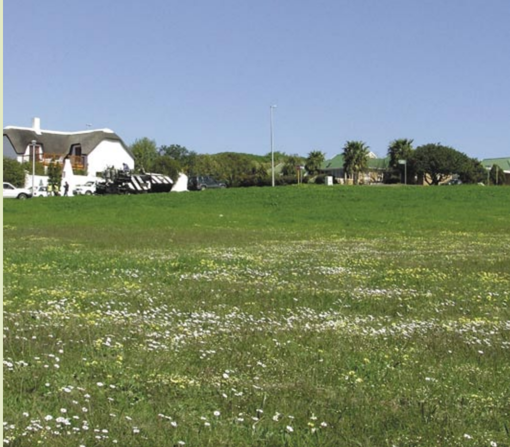
Spring flowers with encroaching Kikuyu grass in the background, St John Street.

Cape Town's precious lowland remnants need more formal recognition and protection